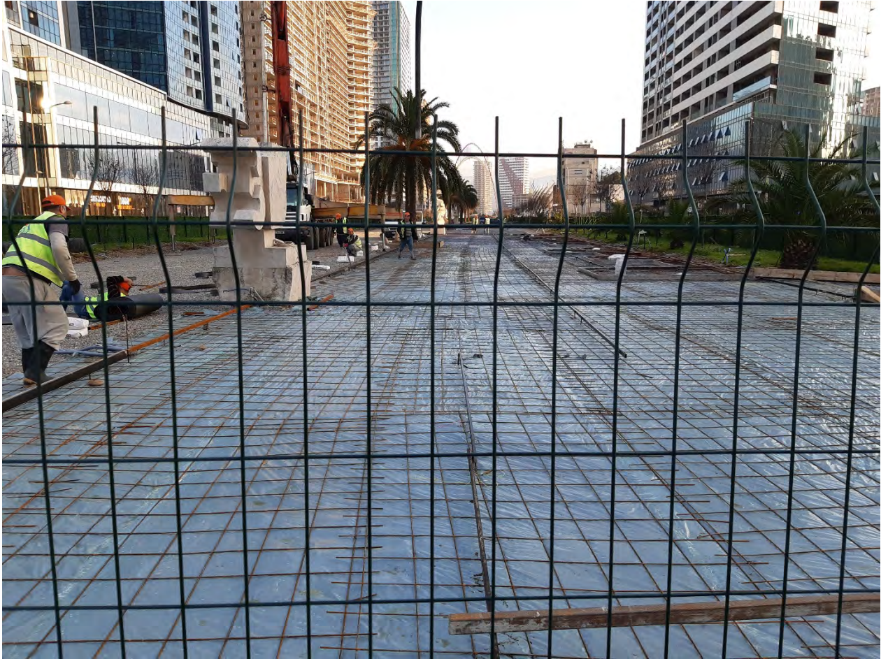
Figure 2, new concrete at seaside of the Boulevard (dec 2021)