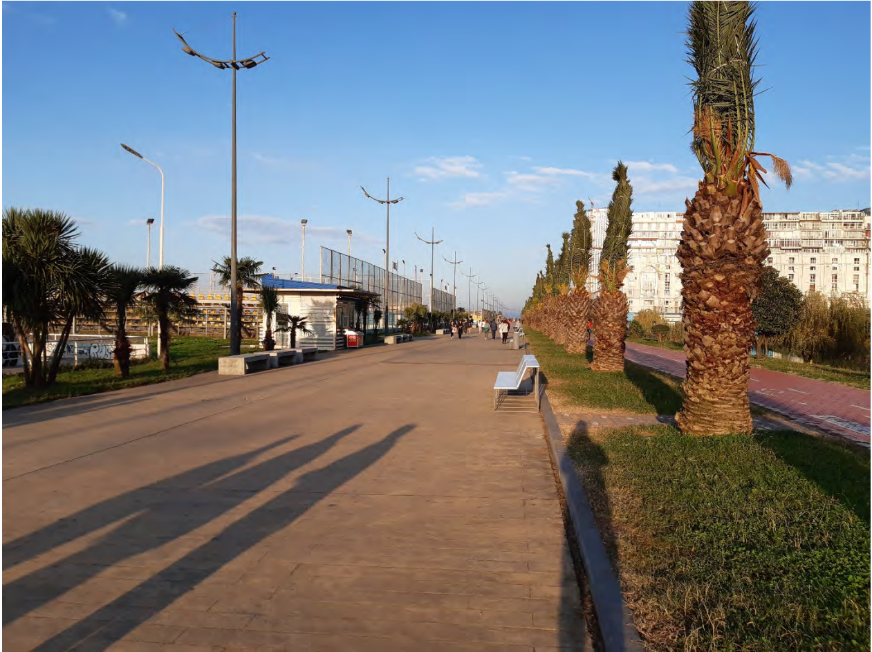
Figure 6, the coastal Boulevard with will be connected to the central boulevard