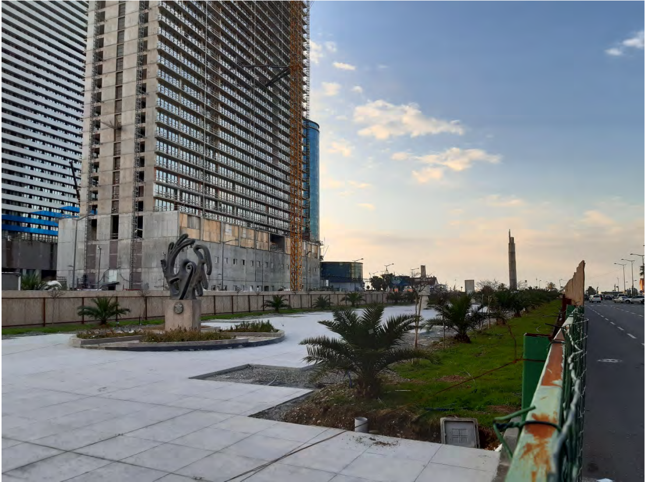
Figure 4, new high rise buildings next to the Boulevard (dec 2021)