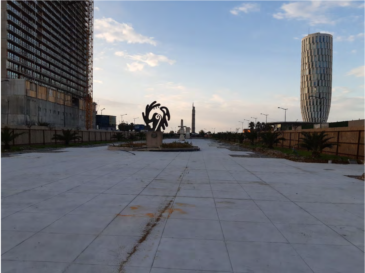
Figure 3, view towards the sea, construction work at the Boulevard (dec 2021)