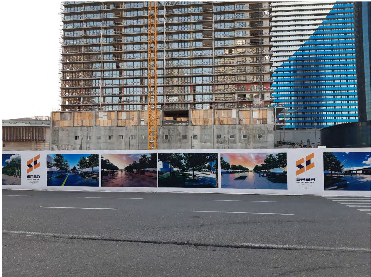
Figure 5, Ongoing construction works next to and on the Boulevard (dec 2021)