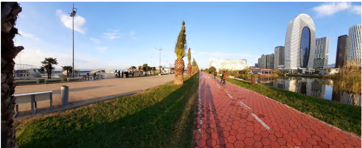
Figure 7, location of the envisaged iconic bridge, vied on the coastal Boulevard