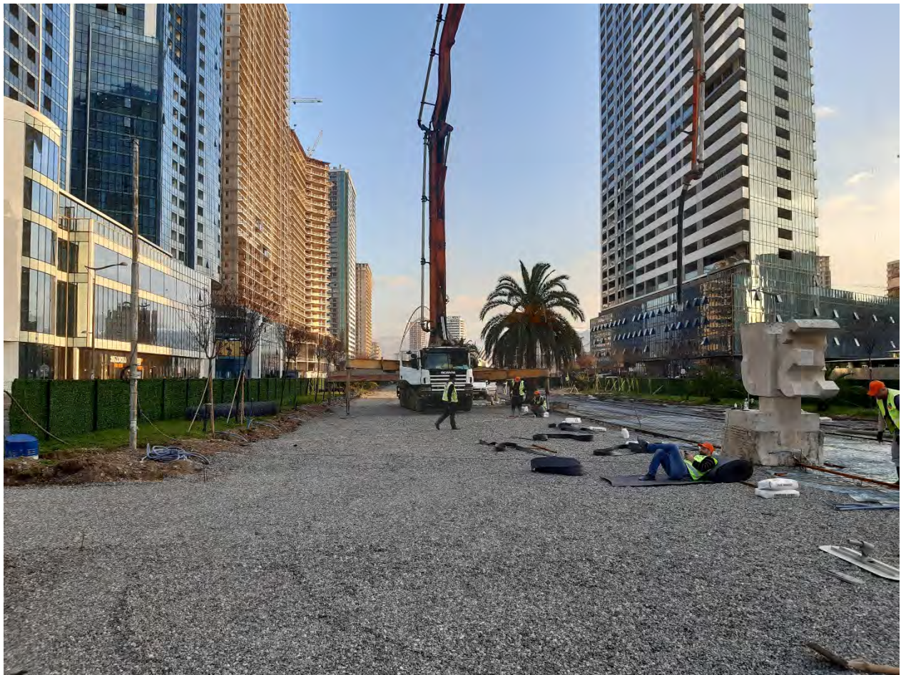
Figure 1. Current construction at the seaside of the Boulevard (dec 2021)